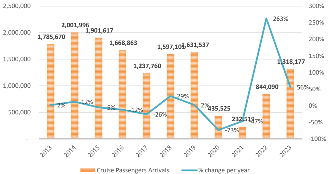
Figure 2. Total number of cruise passengers by annual percentage of change